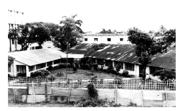
Figure 2. The first Nuclear Medicine establishment of the country "Radioisotope Centre" in Dhaka