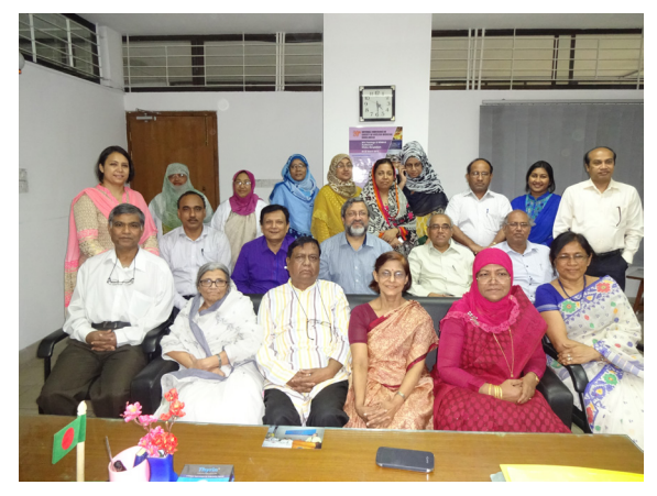
Figure 5. Some of the senior members of Society of Nuclear Medicine (SNMB)

Raihan Hussain AOJNMB Nucl Med History Bangladesh