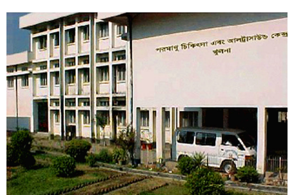
Figure 3. A Nuclear Medicine Institute in a peripheral region of the country

The then INM became an affiliated institute of Dhaka University and course curriculum for one year diploma course was approved in 1987. In 1988 the first batch of Diploma in Nuclear Medicine (DNM) were enrolled in Dhaka University. This was another great leap forward. This created an opportunity for the local young professionals for higher education. Gradually candidates from regional countries like Nepal also got enrolled and completed the course. Eventually after ten years, the one year course was extended to two years masters program (Master of Philosophy) which is still continuing. Now the course is being planned and to be extended for four years (Residency program).