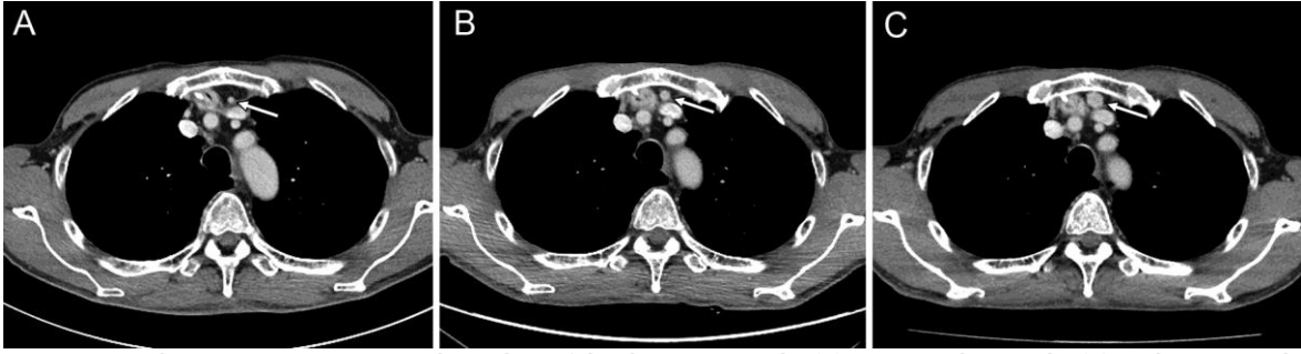
Figure 1. Serial postoperative contrast-enhanced CT of the chest at 3 months ( A ), a year and 3 months ( B ), and 2 years and 3 months ( C ) postoperatively. A small nodule is identified near the reconstructed gastric tube, showing gradual enlargement ( arrows )

density. Upon retrospective review of postoperative contrast-enhanced CT, a corresponding nodule showing gradual enlargement was identified (Figure 1). The nodule showed homogeneously high density, suggesting homogeneous contrast enhancement.