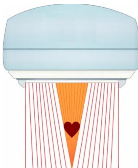
Figure 1. SMARTZOOM(TM) collimator – cardio-centric orbit Configuration of SMARTZOOM(TM) collimator with converging collimator at the centre and parallel whole collimator at the periphery

Cardiac-specific collimators have been introduced, which have improved the acquisition as well as the image quality in MPI. IQ-SPECT technology (Siemens Medical Solutions USA, Inc., Hoffman Estates, IL, USA) uses cardiac specific SMARTZOOM(TM) collimator, which has a combination of a converging collimator at the center and a parallel-hole collimator at the periphery (Figure 1). This technology possesses three critical qualities, which include smart zoom collimation, cardio-centric orbit, and special iterative reconstruction methods. The addition of an SMARTZOOM(TM) collimator has shortened the acquisition time, producing an image of higher quality and resolution than the routinely used LEHR collimators (3).