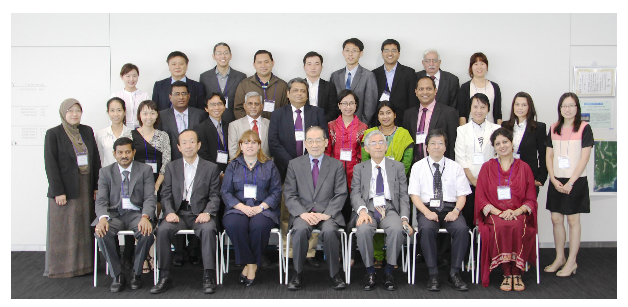
Figure 1. The trainees, lecturers, directors, and NIRS administrators

Kosuda Sh et al AOJNMB IAEA/RCA Training Course in 2014